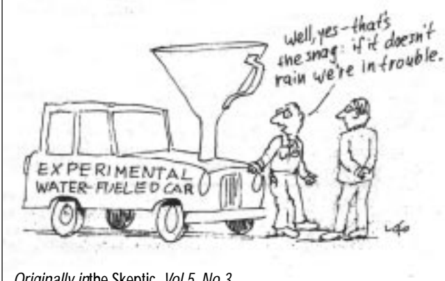
Originally in the Skeptic Vol 5, No 3

electricity generation, heated gases, oscillating pistons, and mechanical rectification by ratchet. It cost a fortune to make, but, to the immense puzzlement of the inventors (who were skilled Italian technicians), it refused to run.